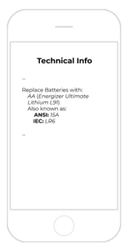
Figure 3. Displaying more than one battery designation in a graphically-rich user interface.

Each designation in the array of designations may be provided in common or colloquial form or in ANSI or IEC standard forms. Additionally, a simple designation identifier may be used alone or it may be augmented with a descriptive string.